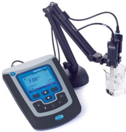
HQD benchtop multi-meter